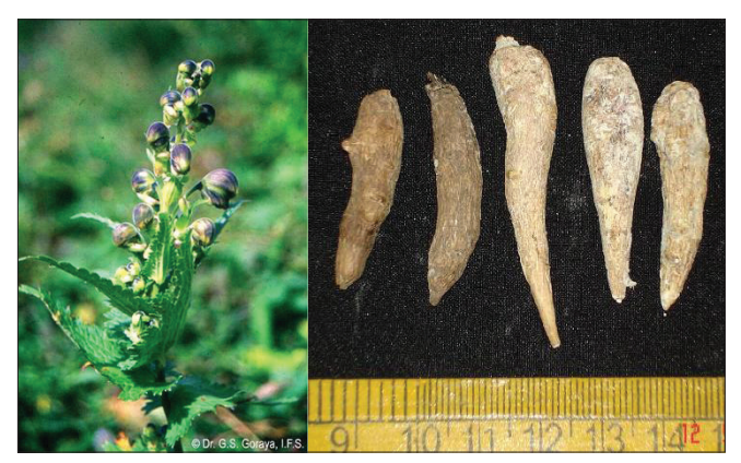
Figure 1: Ativisha (Aconitum heterophyllum Wall. Ex Royle.)

Topics like the one discussed here have evolved within the epistemological framework of Indian Systems of Medicine, whose principles, science and practice are different from those of Western biomedicine. Understanding them therefore requires trans-disciplinary approaches,<sup>[10]</sup> using scientific tools that can provide meaningful insights.