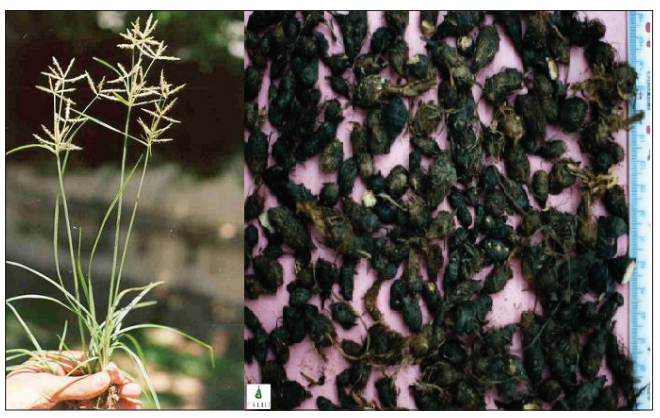
Figure 2: Musta (Cyperus rotundus L.)

Ayurvedic pharmacological parameters (Rasapanchaka) on Ativisha and Musta were compiled from Charaka Samhita,<sup>[4]</sup>