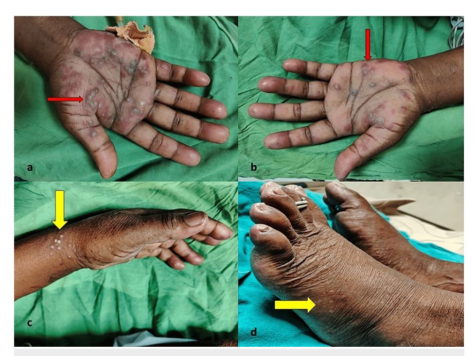
FIGURE 1: (a) and (b) Typical target lesions in palms (red arrow); (c) and (d) Pustules in the upper limb and lower limb (yellow arrow).

On presentation, the patient was dehydrated and agitated, with an ill appearance. Her pulse was 122 beats per minute, and her blood pressure was 90/60 mmHG. Her chest X-ray was normal. Upon physical examination, several 2-12 mm erythematous, urticarial, and targetoid papules were found. These papules had an annular wheal and a hyperpigmented core with purple to red duskiness. The lesions were observed bilaterally on the palms, dorsal hands, upper arms, upper back, trunk, and soles, without mucosal involvement, as shown in Figure 1. Neurologic, respiratory, and abdominal examinations were unremarkable. Consultations with dermatology and infectious disease specialists led to a provisional diagnosis of drug-induced erythema multiforme, considering the positive drug history of the ayurvedic medication 'Jambavasa' and characteristic skin lesions following which the ayurvedic medication was stopped.