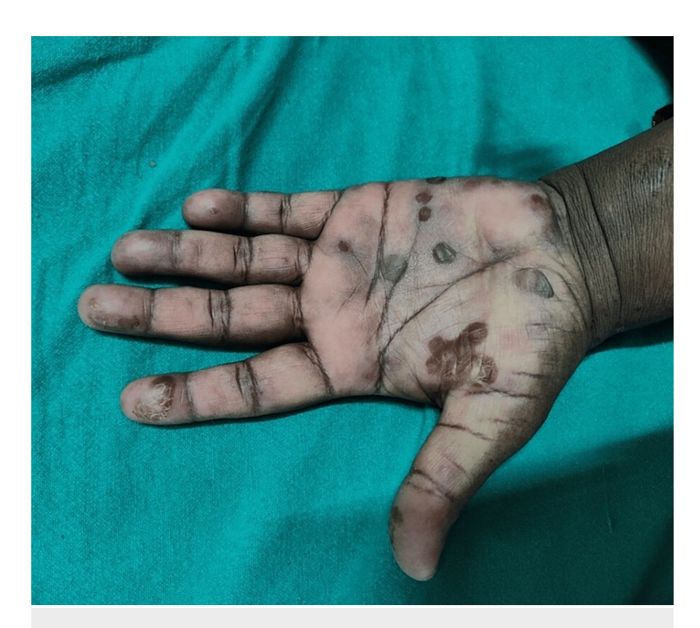
FIGURE 3: Resolving lesions of erythema multiforme.