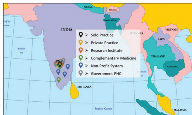
Figure 1: A Map of the general location of the 18 models visited

Following a period of observation, the investigator conducted one informal interview with a healthcare professional at each site. For the purposes of this study, healthcare professionals included: practicing physicians, public health researchers, and program planners. These conversations lasted between fifteen minutes and several hours; time discrepancy was largely dependent on the participant's availability for discussion. The initial minutes of the discussion focused on building rapport with the participant; this included an explanation of the investigator's background, professional goals, and study purpose. The discussion then turned to SDoH more broadly. Questions focused on the provider's general knowledge, local awareness, innate desire, and systemic capacity to address SDoH issues in his/her clinic. Finally, the dialogue covered site-specific topics like funding, staffing, patient population, and other factors.