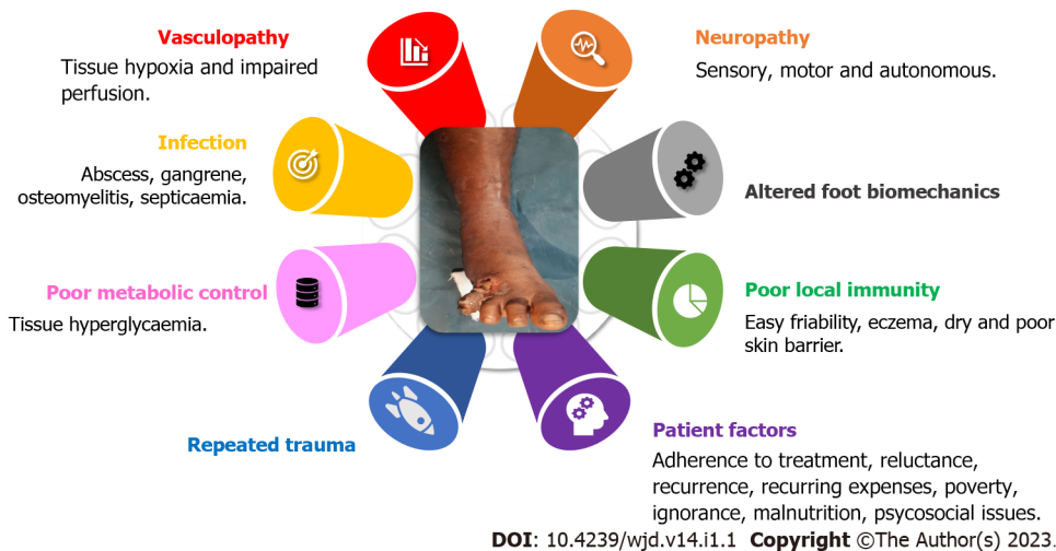
Figure 1 Pathogenesis of diabetic foot ulcers.

resistance, type 2 diabetics are more likely to suffer from long-term complications of vasculopathy, neuropathy, and diabetic ulcers in the lower limbs[1,6]. Irrespective of age, gender, region, or culture, the pathophysiology of a DFU remains the same. Two or more risk factors, often peripheral neuropathy and frequently vasculopathy, are always present[6] (Figure 1).