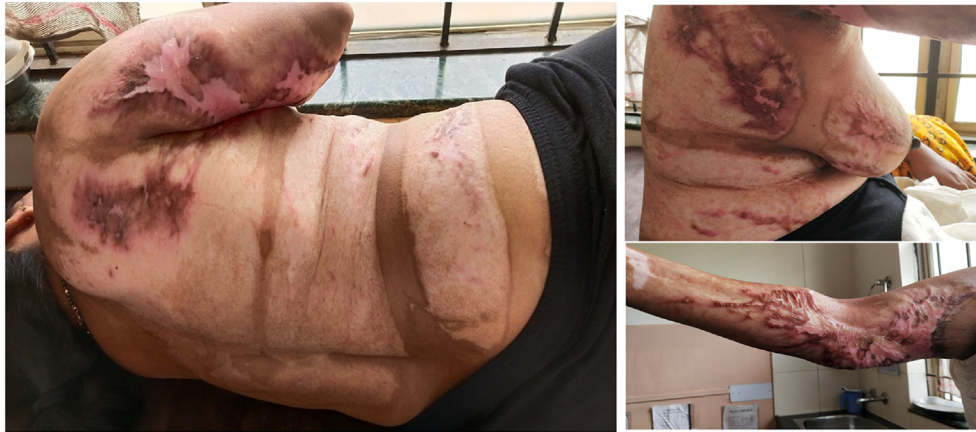
Fig. 4. 60 th day after treatment(A)(B)(C).

Rakshoghna (anti-microbial and anti-fungal), Vranashodhana (wound cleansing), Vranaropana , and Vata pitta shamaka (pacifies Vata and pitta dosha ) properties with its madhura vipaka . This also helps in lubricating the wound surface and prevents eschar formation, as well as insensible loss of fluid from the burn site [14]. Manjishtha is another content, which has active phytochemicals like amino acids, saponin, carbohydrates, alkaloids, glycosides, phenolic compounds, and tannins. It functions as an antitoxic, blood detoxifying, antiseptic, and antioxidant agent [15].