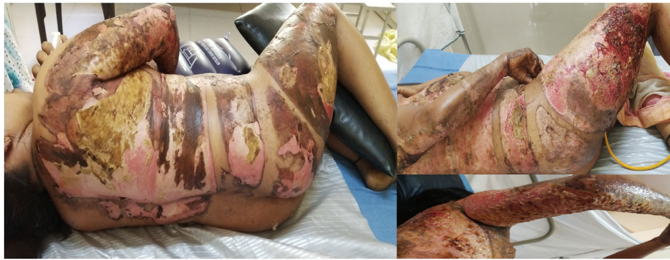
Fig. 2. Initial stage(A)(B)(C).