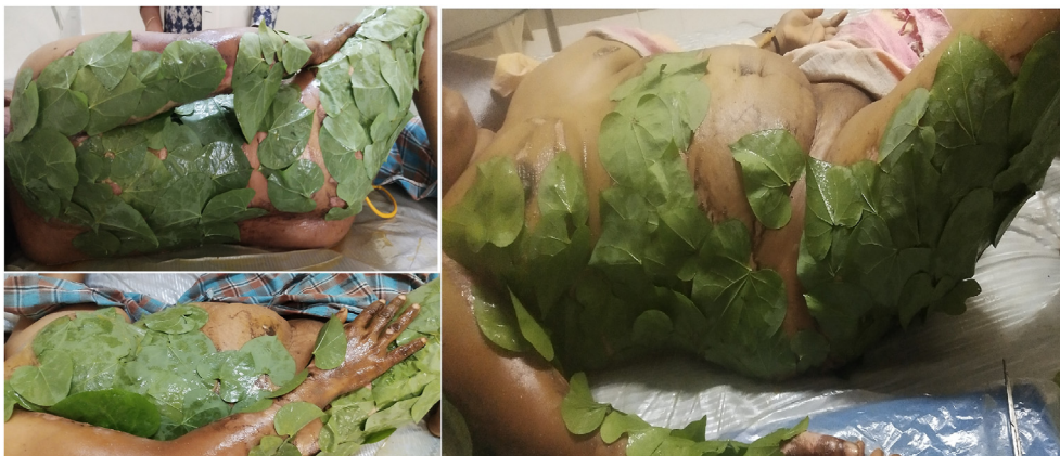
Fig. 3. Ropana ghrita application with Patraadaana(A)(B)(C).

The treatment principles are designed by analyzing the degree of burn and its systemic effect on the body. Initially, the case was managed with standard treatment protocol, i.e., intravenous fluid