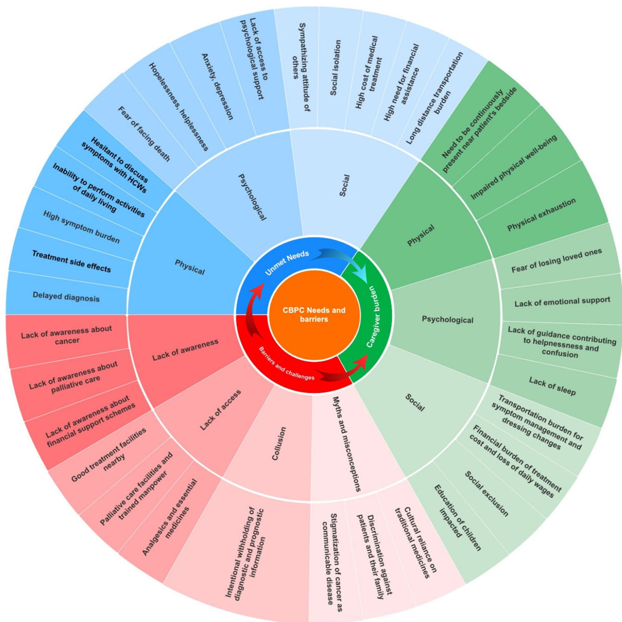
Fig. 3 Thematic map

painkillers on their own. Patients and caregivers found it challenging to travel long distances to the hospital for pain management.